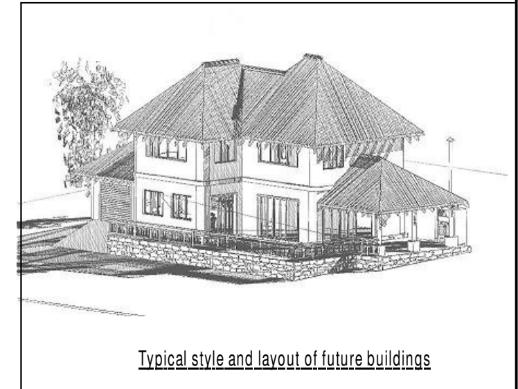
Typical style and layout of future buildings